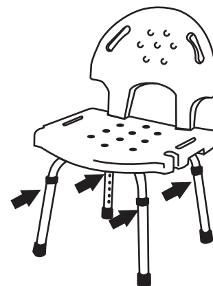
Figure 1: Adjustment areas on legs

WARNING Only use the bath/shower chair on tub and shower floors that are wide enough to ensure stability of all four legs.