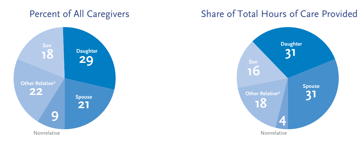
Figure 2 More Than Half of Informal Care Is Provided by Daughters and Spouses.

*Sons-in-law, daughters-in-law, and grandchildren represented 50 percent of other relatives who provide care.